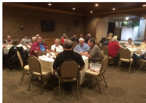
Some of the members and guests settling in for KD8FTS's program at the summer 2017 luncheon.

Thanks to KD8FTS for a most interesting program and demonstration.